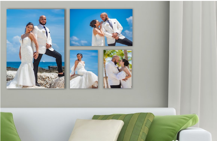
ASPEN Collection Your 4 favorite images available in HD Metal or Premium Canvas finish Overall size - 34" x 24"