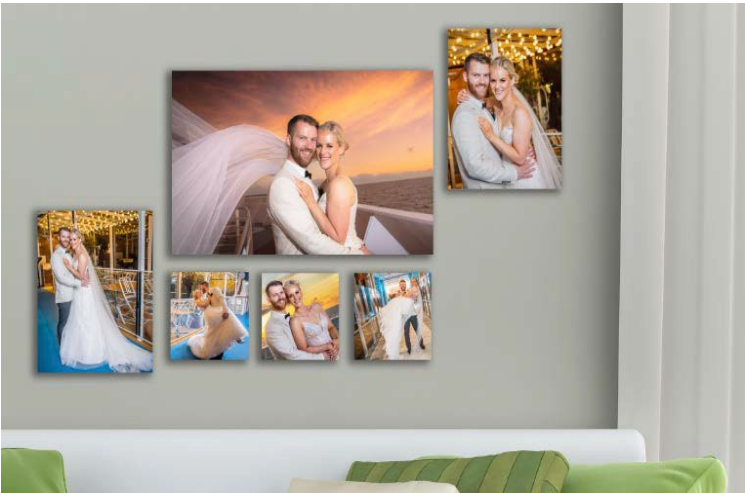
VERONA Collection Your 6 favorite images available in HD Metal or Premium Canvas finish Overall size - 54" x 40"